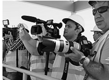
Request Our Pictures